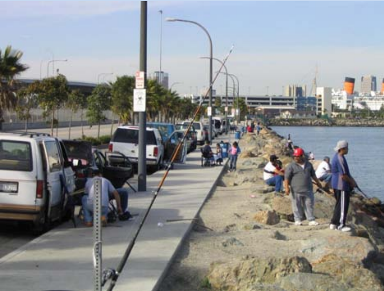
Pier J has a sign on almost every lamp post