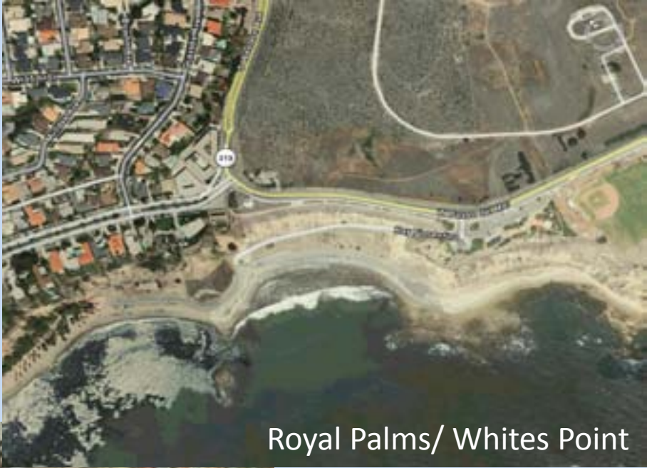
Royal Palms/ Whites Point