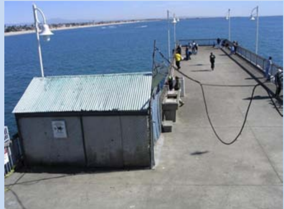
Belmont Pier has two signs