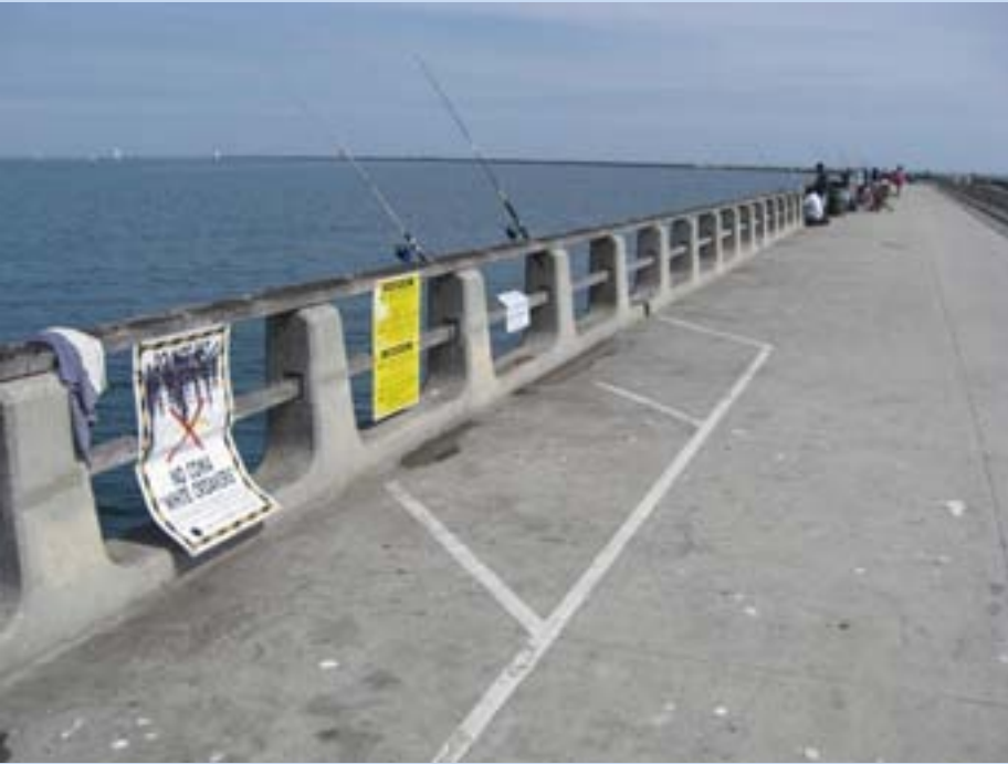
Cabrillo Pier has three signs